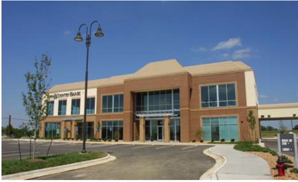
Town & Country Bank Building 4707 W. 135th St., Leawood, KS